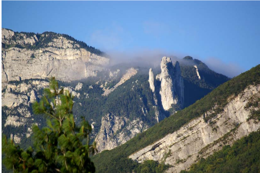
The "three maidens" rocks with, the Moucherotte behind.

For those willing to make some sport, depending on the number of participant (20 is ideal), a third coach will drive you to 1000 metres altitude where you will start a 3-4 hour roundtrip trekking to reach the top of a mountain facing Grenoble valley. Your climbing effort will be rewarded by a beautiful view of the Alps Chain and the Grenoble valley beneath. This option strongly depends on the weather condition and requires a reasonable health condition of the participants. Good walking shoes are required, along with hot clothes in a bag, just in case.