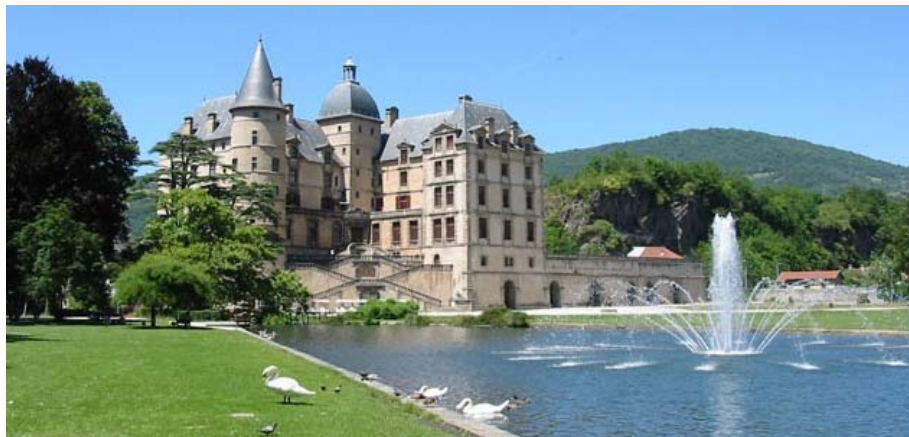
The Vizille castle, where the French revolution really began...

http://www.musee-revolution-francaise.fr/Index.html