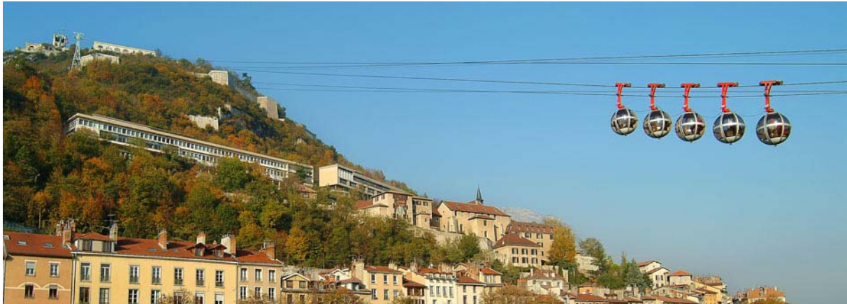
the Bastille cable car

The banquet should be organized in the Bastille Fort, located 250m above the Valley. The restaurant offers a panoramic view over the city. You can either climb by foot to the restaurant or use the “Télépherique” (cable car) to reach the fort.