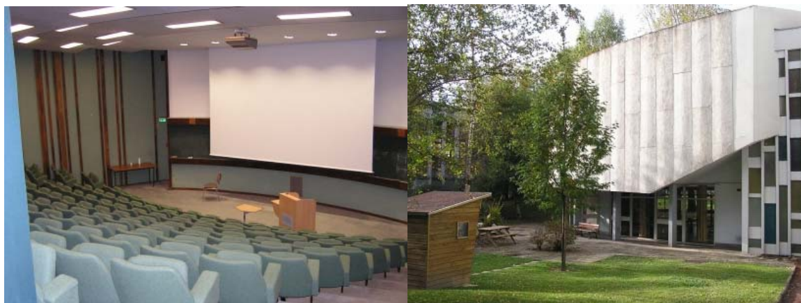
LPSC amphitheatre (left). Cafeteria located directly under the amphitheatre (lunches).

The LPSC amphitheatre is equipped with a large video screen and projector and offers WIFI connection to participants. A computer room will be installed close to the amphitheatre. Posters will be installed directly in the hall in front of the amphitheatre doors.