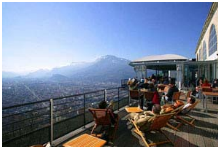
Panoramic view from one of the Bastille Fort restaurants. The Moucherotte mountain is behind.