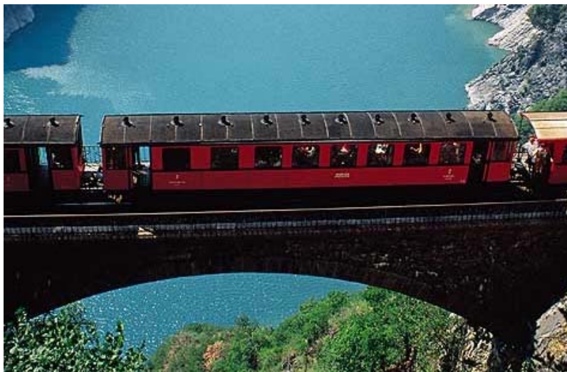
The train of La Mure

http://www.trainlamure.com/pages/en/6/chemin-de-fer-de-la-mure.html